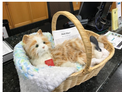
Mac the robot cat in his basket (left) and being loved by a patron (below left).

Many people share stories of dogs or cats (or horses or cockatiels!) they owned in the past.