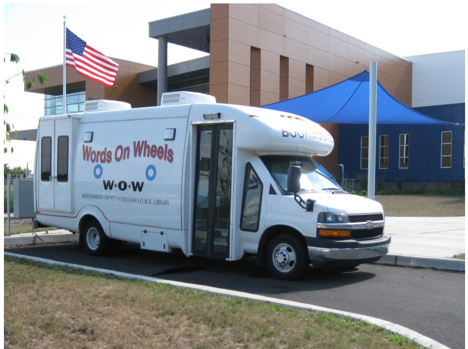
The current Words On Wheels bookmobile is ready to roll!