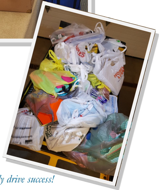
Supply drive success!