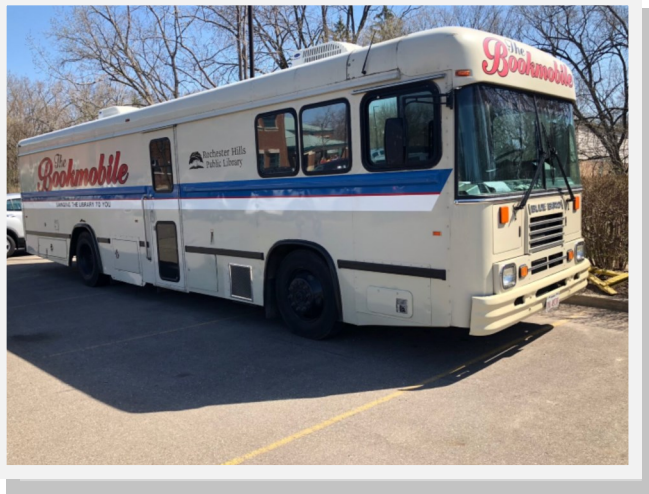
The newly acquired vehicle at its new home in Rochester Hills.